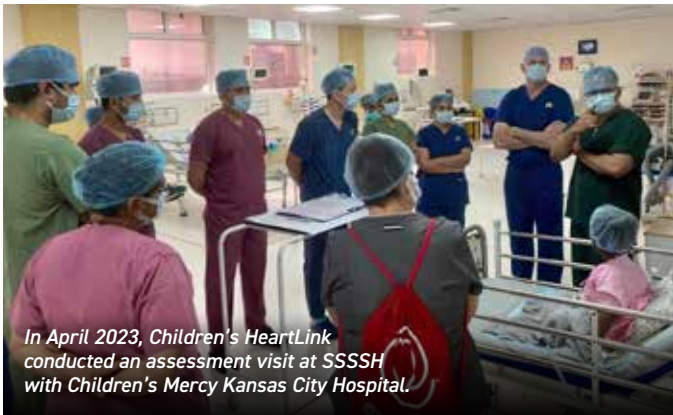
In April 2023, Children's HeartLink conducted an assessment visit at SSSSH with Children's Mercy Kansas City Hospital.

In India, approximately 240,000 children are born with CHD each year, and there is an urgent need for an estimated 144,000 infants to have CHD procedures annually. Nearly 90% of children with CHD lack access to heart care.