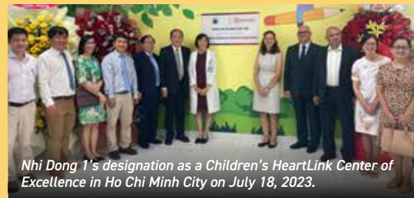
Nhi Dong 1's designation as a Children's HeartLink Center of Excellence in Ho Chi Minh City on July 18, 2023.

Learn more at: childrensheartlink.org/VietnamSuccess