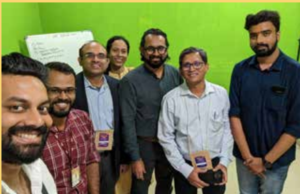
Inside the VR lab at Children's HeartLink Center of Excellence Amrita Hospital, Kochi, India.

Through the integration of cutting-edge technologies like virtual reality (VR) and augmented reality (AR), our partner hospitals continue to transform care for children with CHD. Children's HeartLink is embracing virtual training to enhance heart care training on a global scale. This year volunteer nurse educators supported the first-ever virtual Nurse Residency Program, connecting nurses in India and Malaysia with live and on-demand trainings. Additionally, our mini-symposium virtual lecture series with partner hospitals in Brazil completed its third year, and virtual case discussions continue each week to unite heart care teams from partner hospitals worldwide with their medical volunteer teams. These technological advancements complement in-person training, enabling year-round learning and relationship development between partners and volunteers.