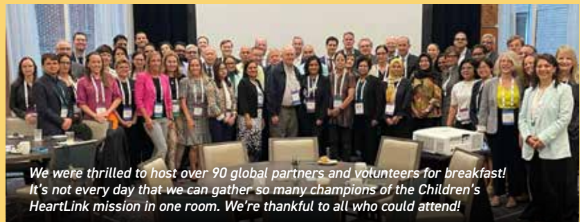
We were thrilled to host over 90 global partners and volunteers for breakfast! It's not every day that we can gather so many champions of the Children's HeartLink mission in one room. We're thankful to all who could attend!

Learn more at: childrensheartlink.org/8th-world-congress-recap/