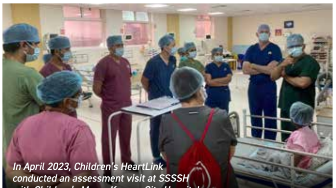
with Children's Mercy Kansas City Hospital.

In India, approximately 240,000 children are born with CHD each year, and there is an urgent need for an estimated 144,000 infants to have CHD procedures annually. Nearly 90% of children with CHD lack access to heart care.